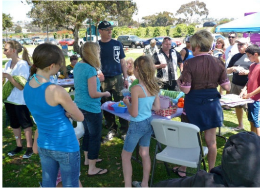
Over 100 people showed up!