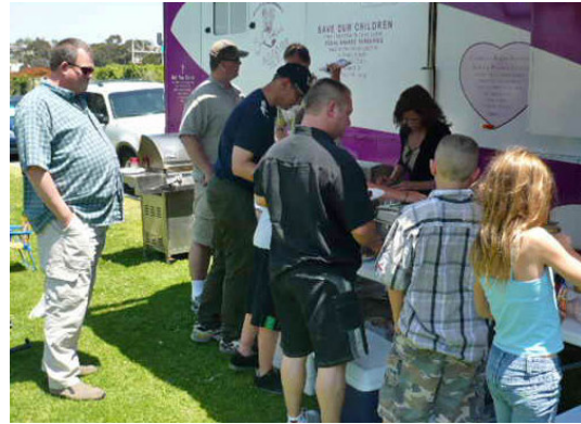
The Food Line